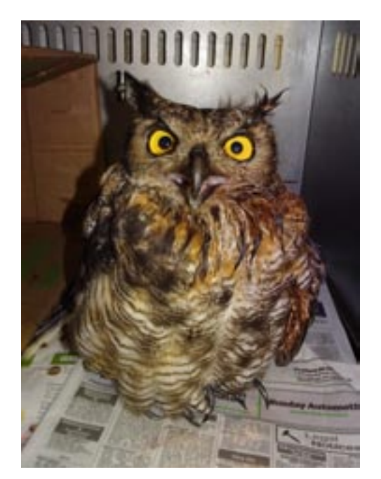
Great horned owl, 2020