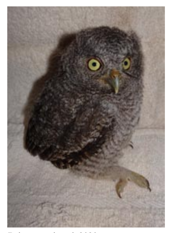
Baby screech owl, 2020

During 2020, volunteer, Esther Plummer, was able to capture more than two dozen cranes and wading birds which needed to be rescued due to various injuries. Great job!