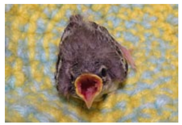
Baby mocking bird, 2020

During 2020, volunteer, Esther Plummer, was able to capture more than two dozen cranes and wading birds which needed to be rescued due to various injuries. Great job!