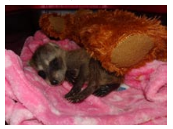
Here are photos of just a few of the baby raccoons admitted for care in 2020.

During the spring and early summer months, orphaned raccoons were very plentiful. There were times that there did not seem to be a way to admit one more, and yet, we did. I have several volunteers who are listed on my Florida wildlife permits to care for animals in their homes and on their property. Without their kind help, many of these babies would have died; and I owe all of these wonderful volunteers my gratitude for a job well done.