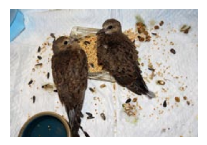
Mourning doves, 2020