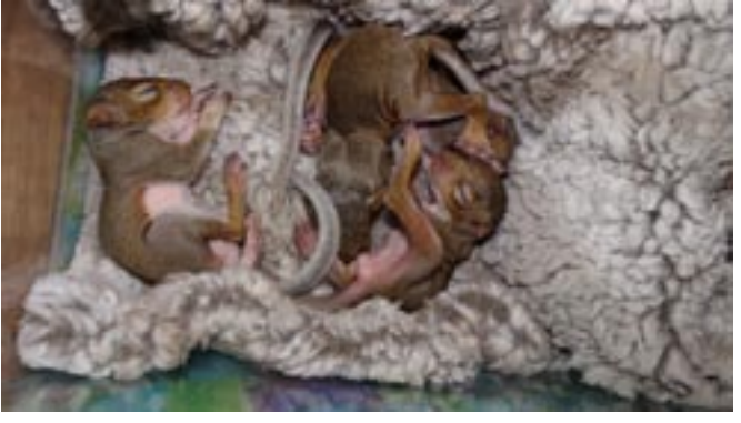
E. Gray squirrels in care 2020