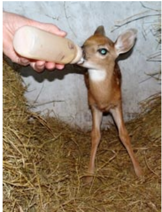
A bottle of warm formula does the trick.