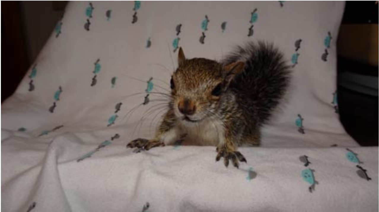
E. Gray squirrels in care 2021

Once again, we received a multitude of baby orphaned gray squirrels in August and September. I am grateful to Esther Plummer for going on rescues and raising more than two dozen babies at a time. Our bottle feedings just for squirrels were 2 hours, 4 times per day at the peak of the season. That doesn't leave much time for other duties, but we managed.